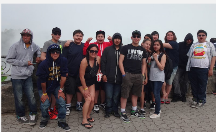
Grade 8 Graduates from Kashechewan Above on their trip to Toronto, June, 2014.

On behalf of FNEI, we congratulate the graduates, and we wish them well in their future endeavours!!