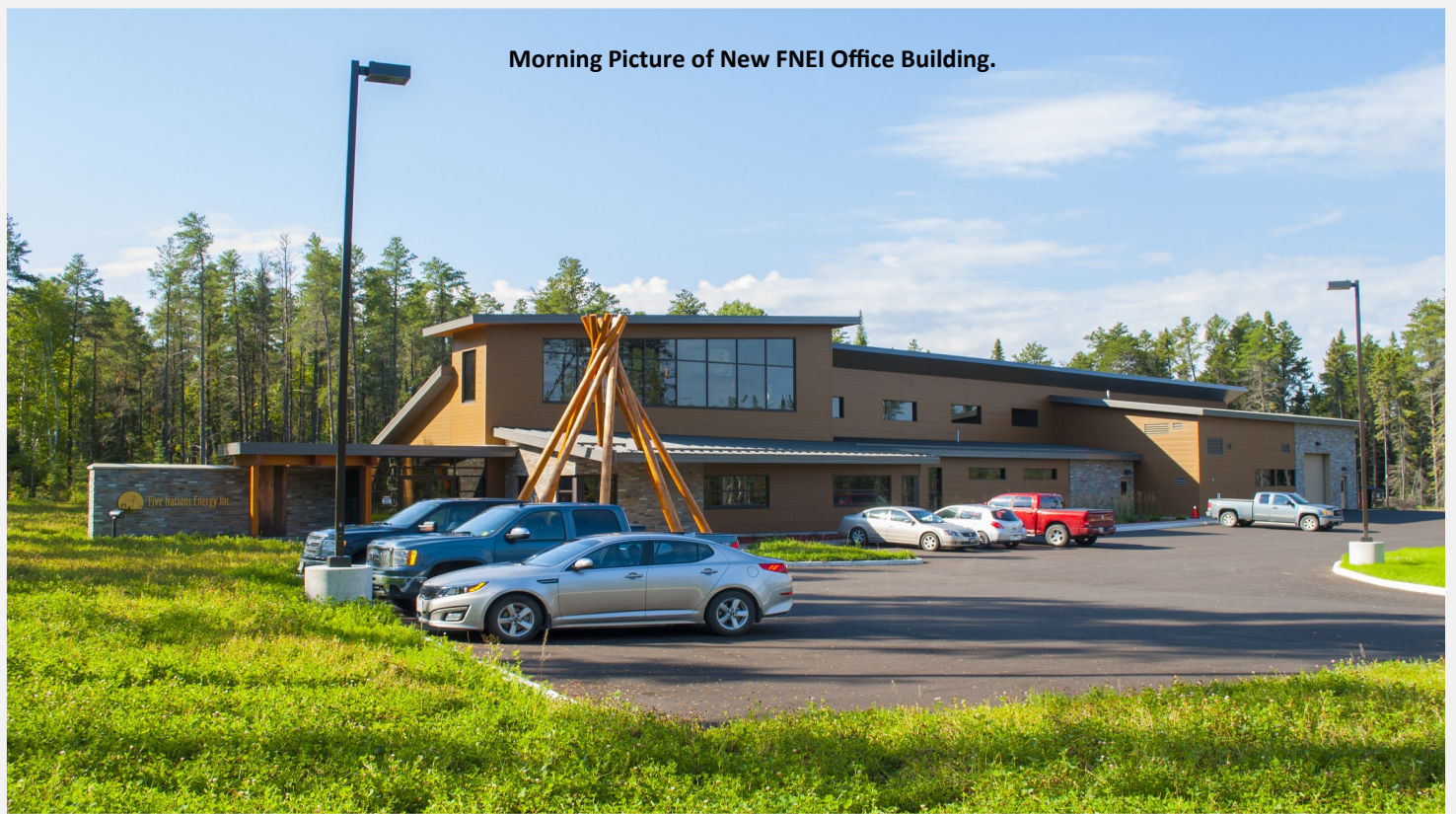
Morning Picture of New FNEI Office Building.