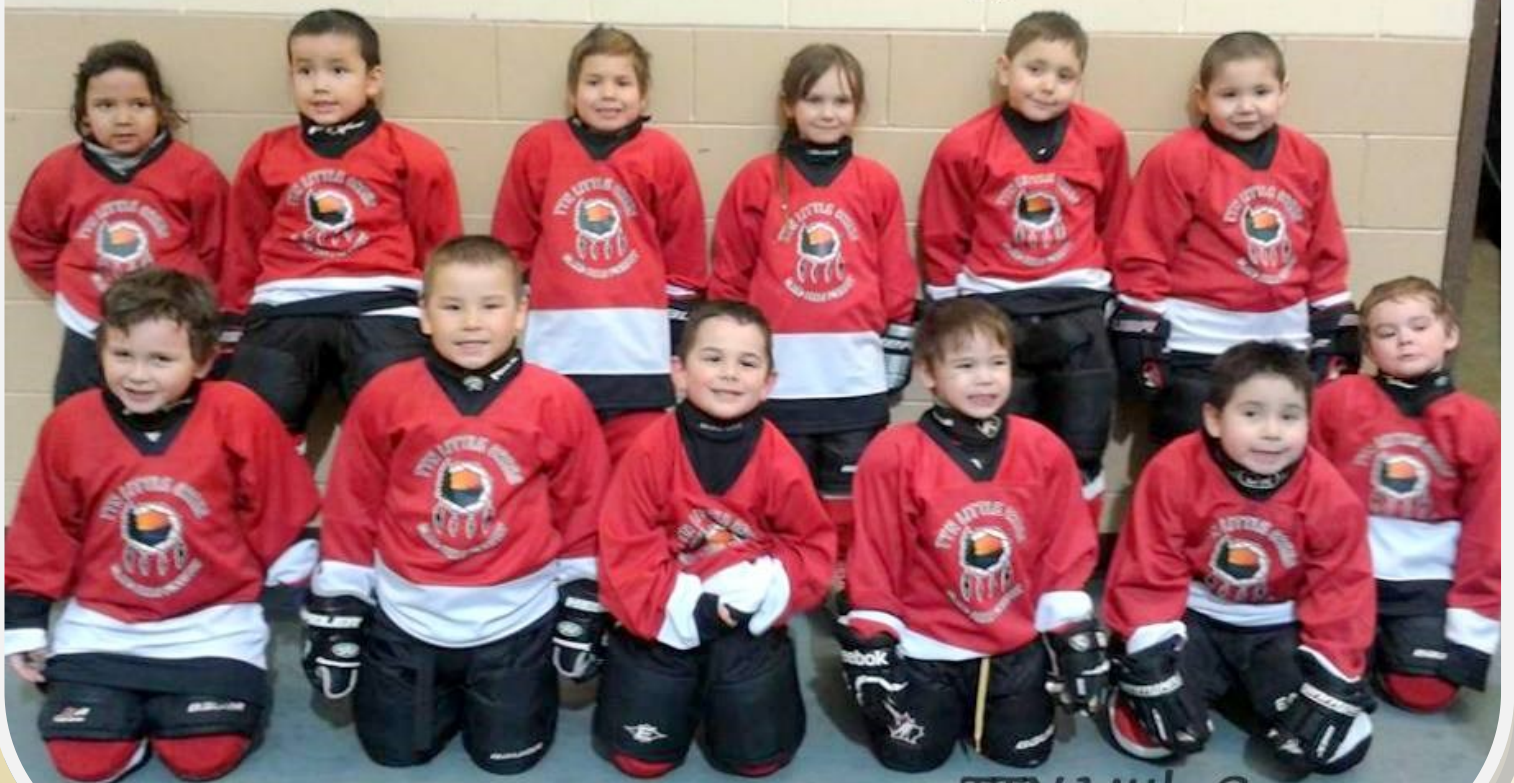
TTN Little Crees