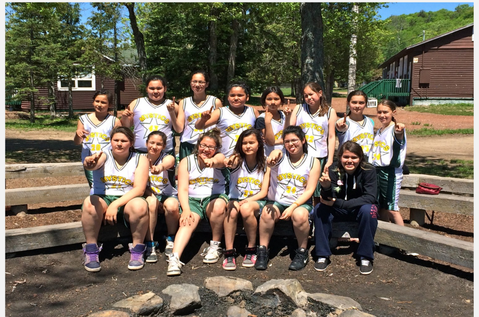
The Ministik School Girls Basketball Team 2014

Thank you again for your generous financial support. We could not have done it without you.