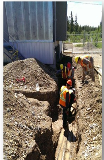
Picture to the right: → Fort Albany Transformer Station, working on the cables