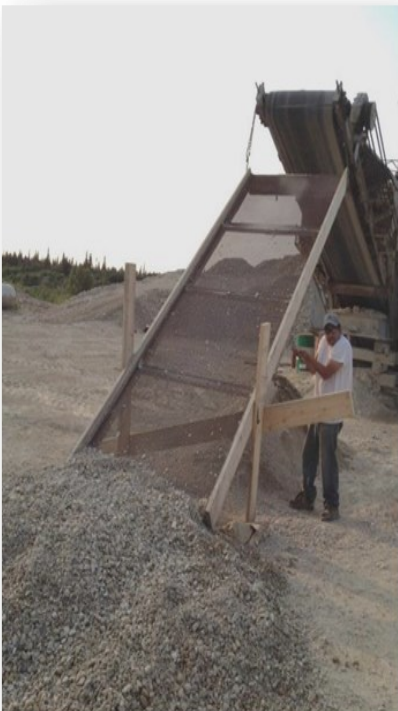
← Picture to the left: Fort Albany gravel pit, crushing and screening gravel

FNEI has started working on the Bus isolation project, the system configuration will be changed to allow for better reliability and flexibility. Expect some extra outages during installation. Some jobs are already done in Fort Albany this season.