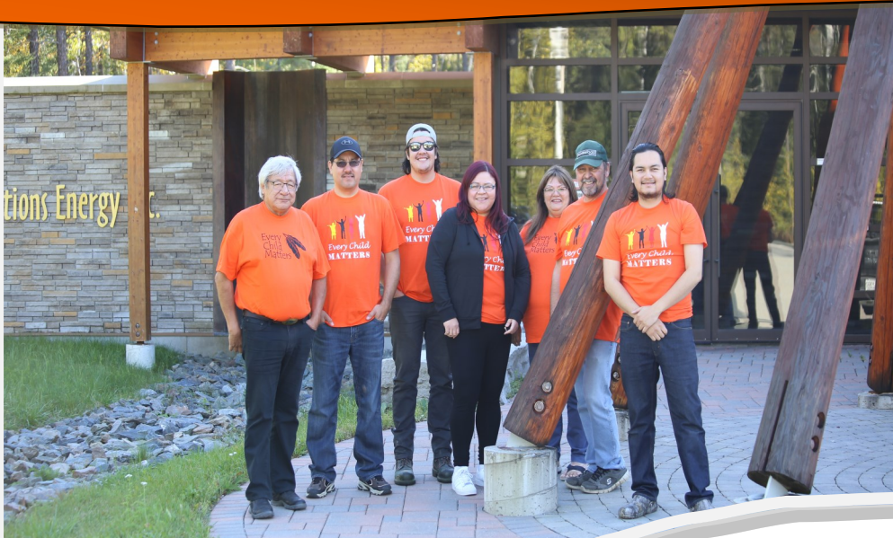
Picture of FNEI Staff - Orange Shirt Day In Honor of Residential School Survivors' and In Memory of Those Who Did Not Make it Home.